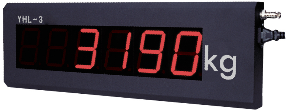
Common type YHL-3